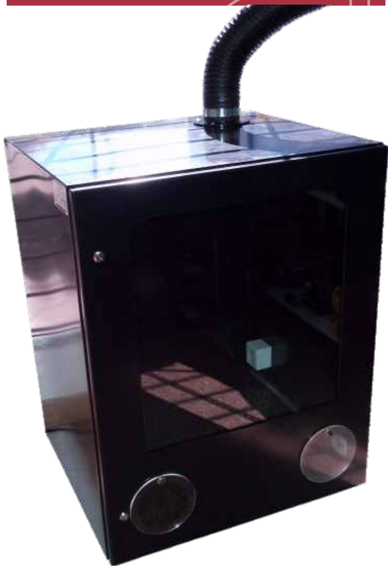
Detail removable tray